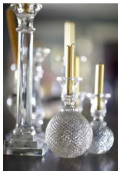
LEFT: Glass candlesticks from One Kings Lane. ABOVE: The collection's brass cobra candlestick.