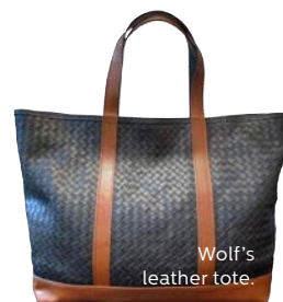
Wolf's leather tote.